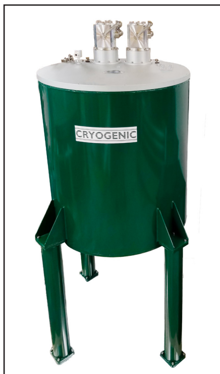
600 MHz Wide RT Bore Magnet

NMR superconducting magnets deliver high magnetic field homogeneity over the sample volume and excellent temporal field stability. The NMR experiments are typically conducted at fixed field, in persistent mode. Our cryogen-free systems provide this environment, while eliminating the need for liquid cryogens.